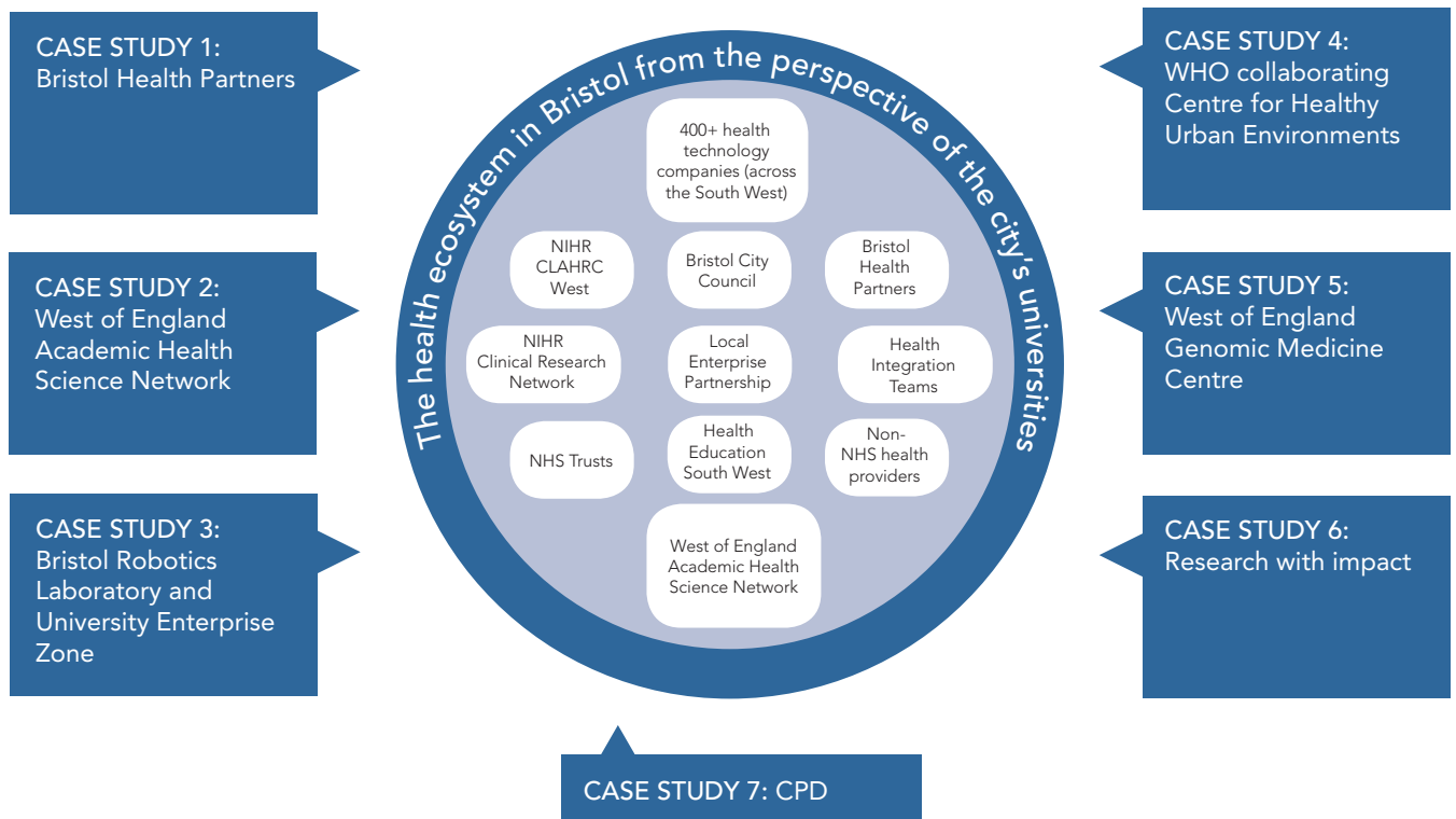
Figure 4: The Bristol City Region health ecosystem

decade, pupils in Bristol on free school meals remain well behind their more advantaged peers in obtaining good GCSE grades. Furthermore, virtually all of the city's wards to the south and east are in the bottom quintile of university participation nationally, while those in the north-west sit in the top quintile. The availability and costs of housing are big concerns too. Bristol South MP Karin Smyth recently identified that more than 10,000 people are on the waiting list for social housing as demand continues to exceed supply. Bristol is also experiencing above-trend house price inflation and, like everywhere else, an ageing population with implications not just for housing but for local planning and services.