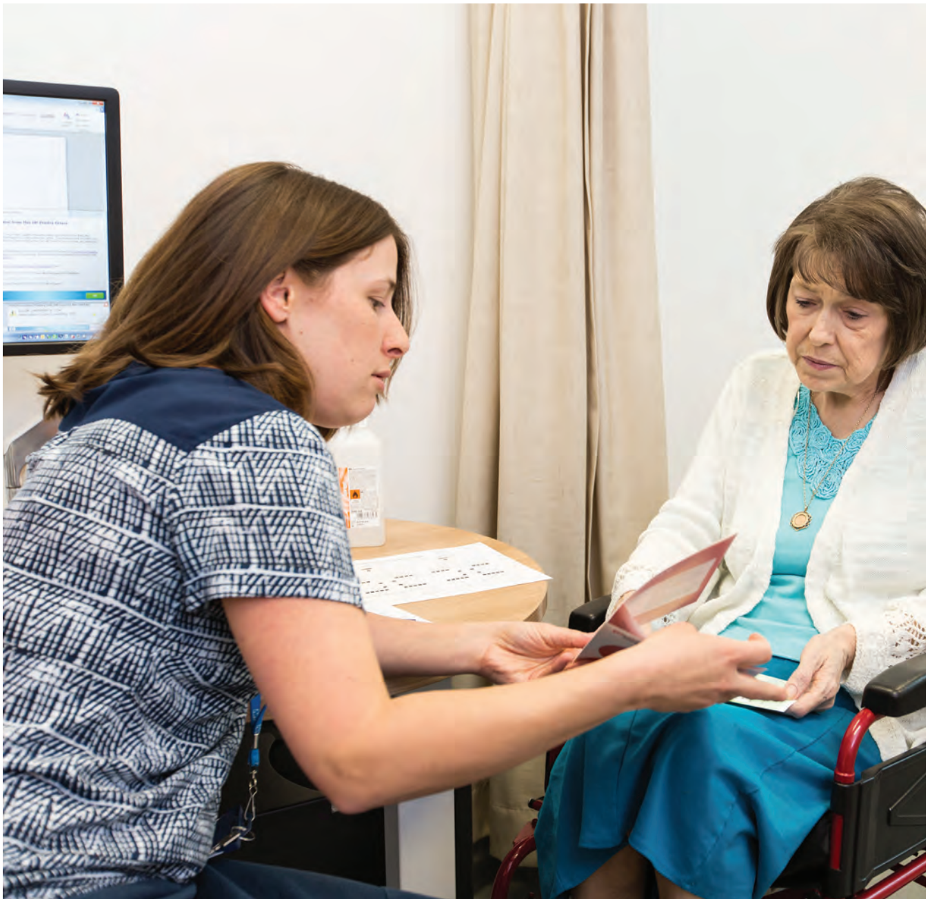
Alongside advances in osteoarthritis, osteoporosis and inflammatory arthritis research, the Bones and Joints Health Integration Team has increased the proportion of older patients receiving cemented hip replacements from 40% to 92% across Bristol.

promoting healthy life expectancy; supporting inclusive neighbourhood environments; chronic kidney disease; sexual health improvement for population and patients; and addictions. BHP is currently working with the NIHR Collaborations for Leadership in Applied Health Research and Care WEST (CLAHRC West) to describe and evaluate the HIT model.