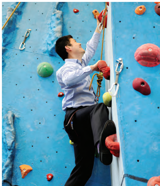
Staff and students at Teesside University are able to access a range of activities to encourage them to improve their health and fitness during the annual Festival of Wellbeing. Held throughout September and October, the Festival offers the opportunity to try out a wide range of sports and activities, from rock-climbing and Tai Chi, to yoga and table tennis.

More generally, it is evident that participating in higher education yields positive long term health benefits for the individual. Research shows that graduates can expect to live eight years longer on average than those with lower levels of education. They are also less likely to drink to excess, smoke or become obese, and more likely to have better mental health, enjoy greater job satisfaction and seek preventative care such as cancer screening. 7 In short, the lifetime advantages of going to university extend well beyond the acquisition of higher level skills.