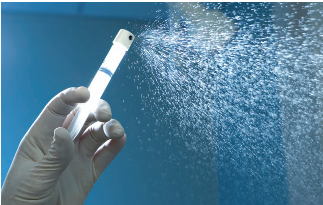
A Knowledge Transfer Partnership between the University of Huddersfield and Avita Medical Ltd is helping the company to better understand the ability of its lead product ReCell® to work so effectively on treating burns, skin defects and scars. ReCell® can be used by a clinician to rapidly create a treatment solution called Regenerative Epithelial Suspension (RES™) using a small sample of the patient's skin. This image shows RES™ sprayed using the Avita's ReCell® device.

NHS Trust on a hospital energy-saving scheme, it did not have the expertise or resources to extend the programme more widely. However, a Knowledge Transfer Partnership (KTP) formed subsequently with Oxford Brookes has made it possible for the company to work with other NHS Trusts.