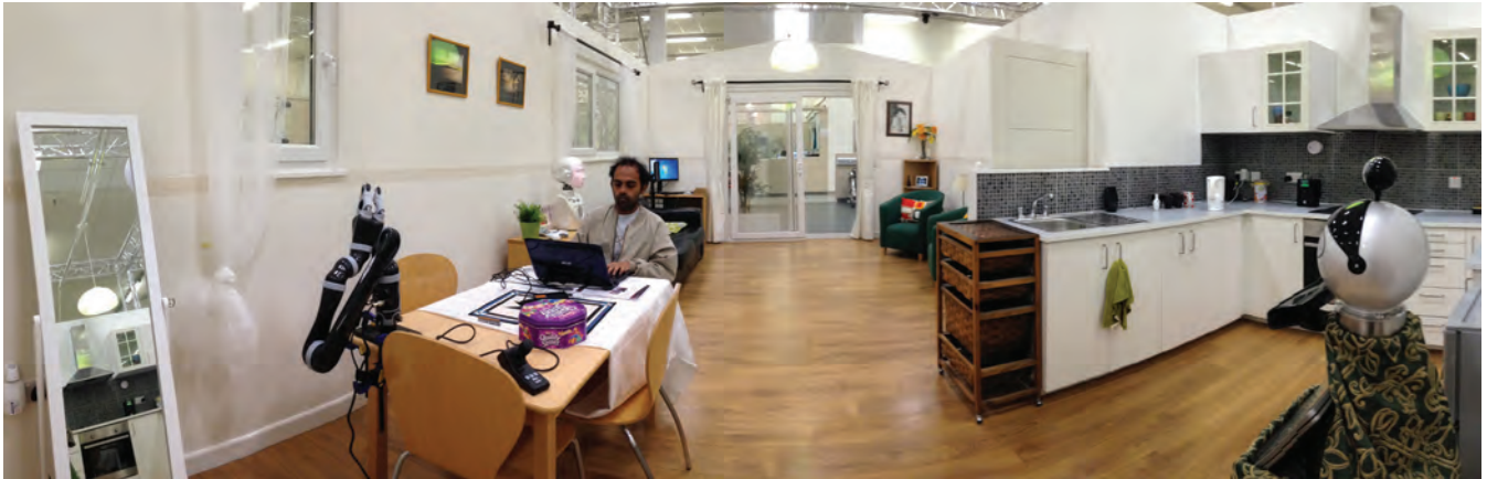
Assisted Living Lab in the Bristol Robotics Laboratory, a collaborative partnership between UWE Bristol and the University of Bristol which is the most comprehensive academic centre for multidisciplinary robotics research in the UK.

UWE Bristol and the University of Bristol