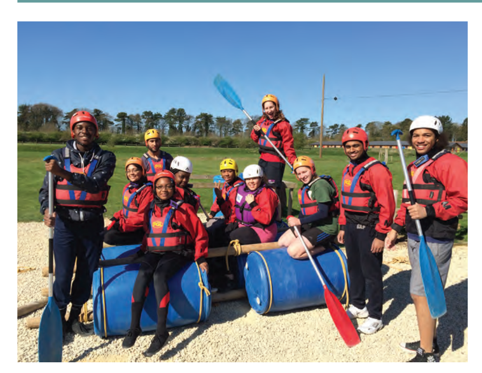
A programme of social activities including adventure weekends organised by the University of Hertfordshire aim to ensure widening participation students feel a part of the university community.