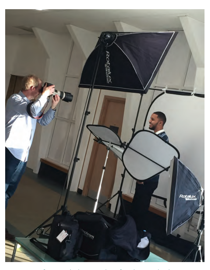
Having professional photos taken for their Linkedin pages can help ensure University of Hertfordshire students stand out as they enter the workforce.

success of the individuals that pass through their organisations. Kingston University has reduced their BME attainment gap by one third between academic years 2011-12 to 2014-15 and Hertfordshire had reduced theirs by 7% up to 2014/15. The University of Greenwich is working towards its Race Equality Charter Mark – another policy incentive – and Hertfordshire and Kingston hold two of the eight current Bronze Awards, with commendation for being beacons of good practice regarding their inclusive teaching work and for sharing their approach with other universities.