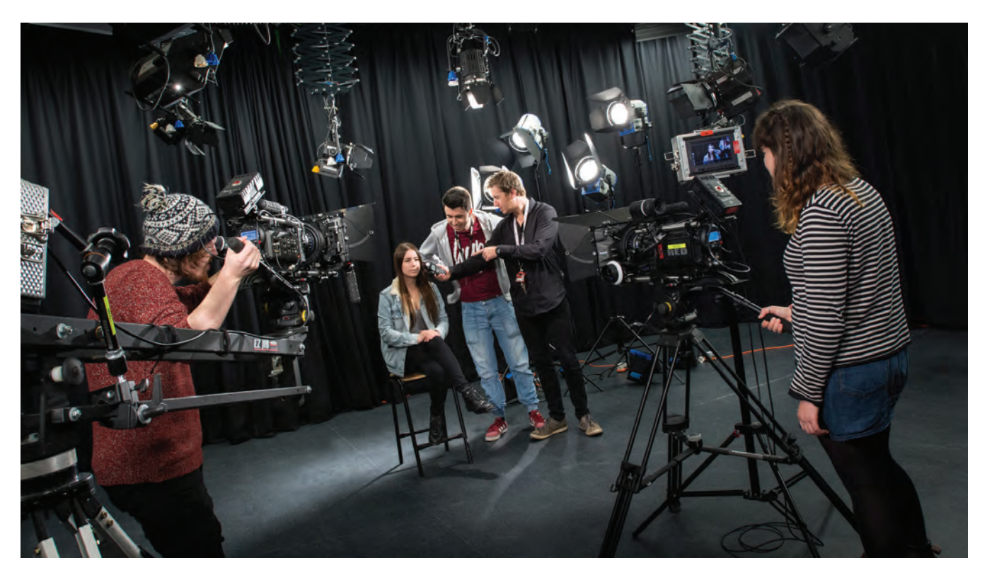
UWE Bristol led two large consortia bids to secure funding for more than 150 paid internships and a small number of apprenticeships to offer to young people in the creative industries sectors. This is the largest scheme offering such opportunities anywhere in the UK through the Arts Council's Creative Employment Programme.