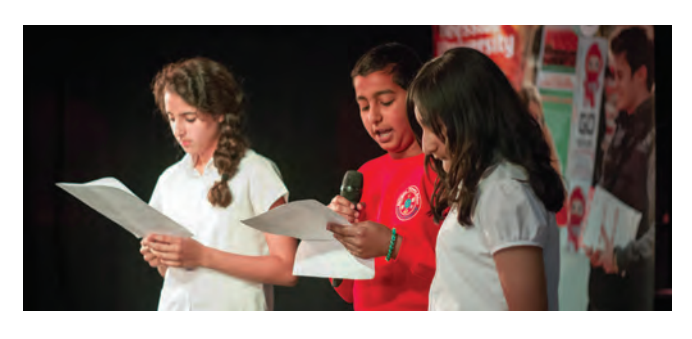
Teesside University has been working with refugees and asylum seekers in Middlesbrough to improve education provision and life chances. This work also creates opportunities for university students to engage with people from diverse backgrounds.

local stakeholders – Salford City Council, Salford CVS, schools, GM Chamber of Commerce, to name just a few – to link their strategy to Greater Manchester's regional and national equality groups, develop an Equality Charter for Salford and coordinate data and information sharing, including methods of best practice. They are also working to gain a better understanding of the diversity of their local communities through developing a Community Cohesion Strategy for the city which improves knowledge of community identity, promotes belonging and creates better links to academic research in the city (and beyond) to inform decision-making for example around mental health challenges.<sup>30</sup>