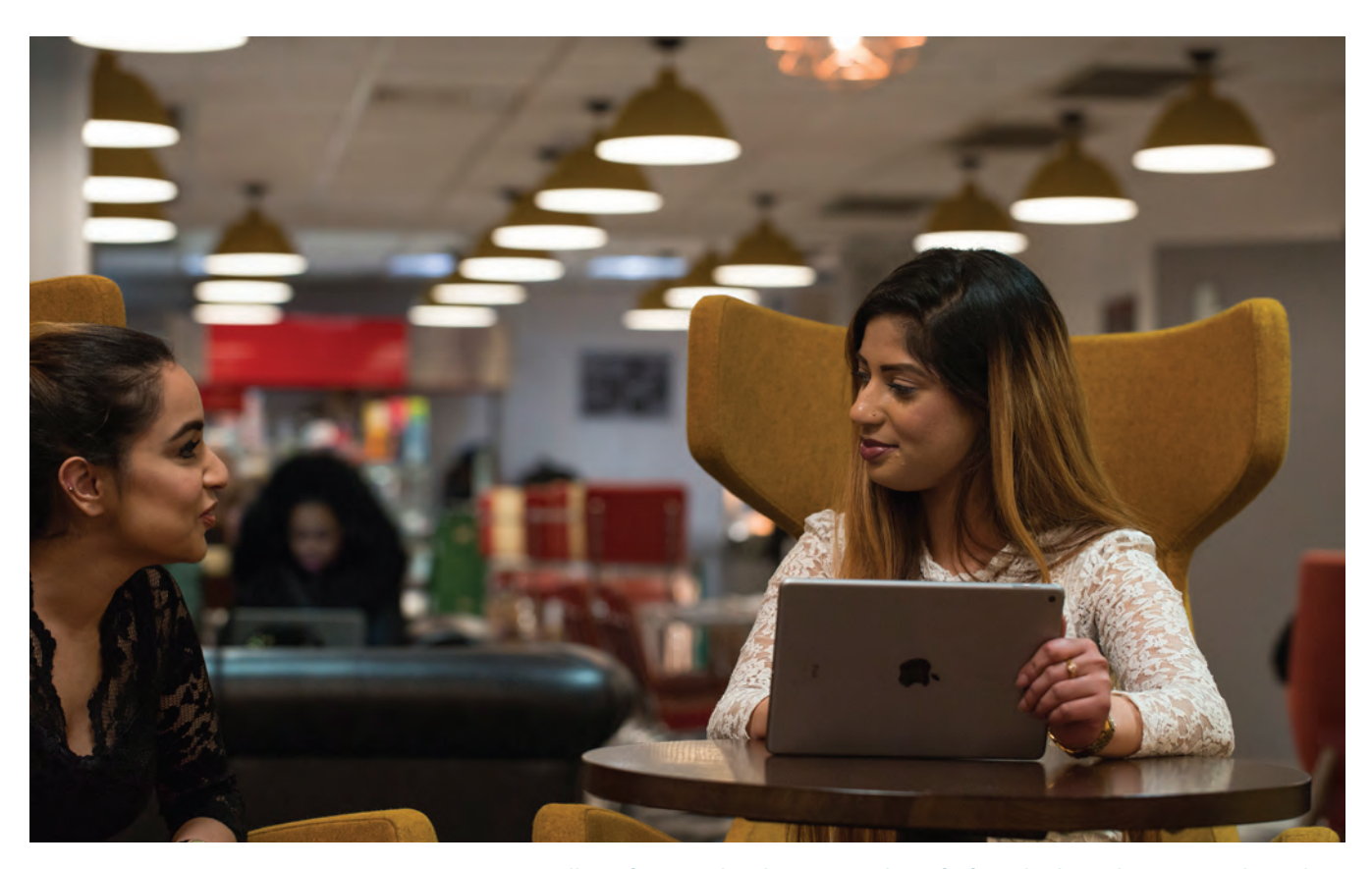
Coventry University set up Coventry University College for people who want to benefit from high quality courses but who have decided that the traditional student experience is not for them. It delivers flexible study options which meet the needs of students and employers, by offering full-time, part-time, work-based and distance learning programmes.