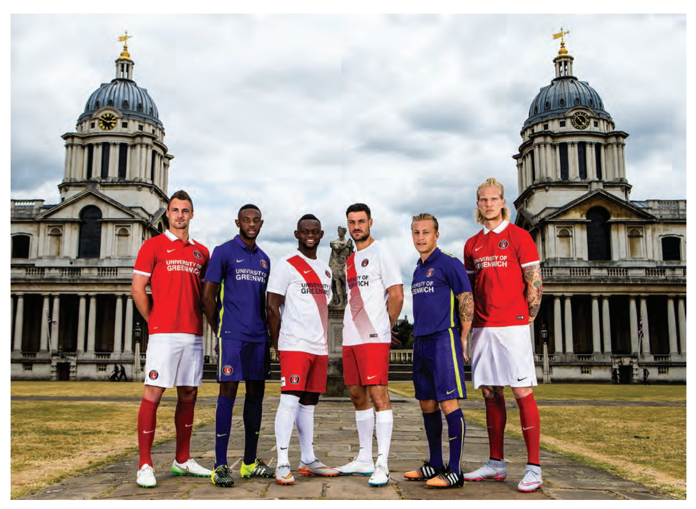
An innovative partnership between the University of Greenwich and Charlton Athletic Football Club combines resources to help local people and organisations including schools, hospitals and community groups. The university's students are among those to benefit from the partnership, including having access to some of the state-of-the-art sports, exercise and training facilities at Charlton's training ground, which sits next to the university's Avery Hill Campus.

The University of Hertfordshire, for example, employs a large number of local people and the local population is not particularly diverse. Consequently, the university is looking at anonymous recruitment for academics as a way to tackle this and they have introduced a Postgraduate Scholarship Scheme with positive initial results: of the 70 students supported so far, 25 were NSP students, about 10% of the NSP cohort. Similarly, the University of Greenwich has set up its Careers Pathways Programme which aims to improve the transparency of the promotion process making sure that all staff are clear about what is expected for them to progress.