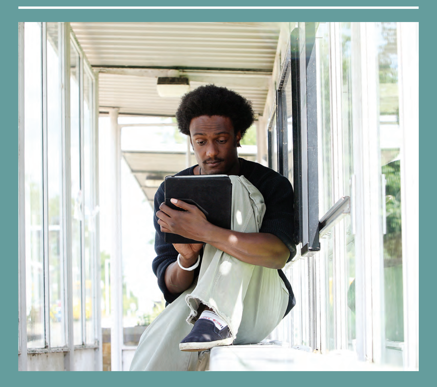
University Alliance Regional Leadership Series