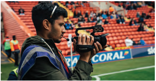
University of Greenwich students can film with Sky at Charlton Athletic Football Club as part of the Greenwich Bright enterprise initiative. Greenwich Bright helps local businesses and community groups to develop their projects and then uses students with appropriate skills to deliver the work - providing them with valuable work experience related to their studies.