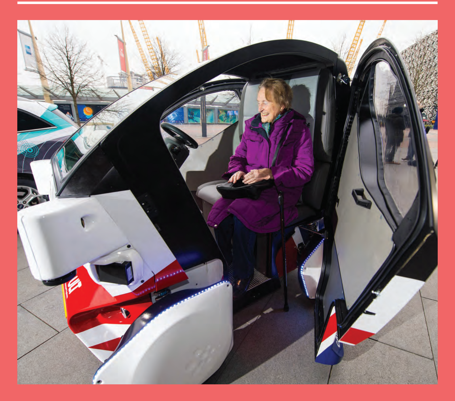
University Alliance Regional Leadership Series