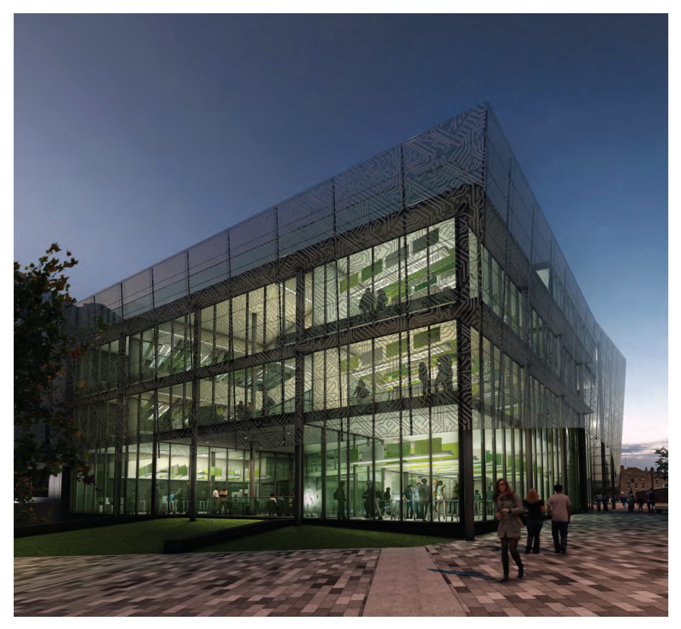
Liverpool John Moores University Enterprise Zone in collaboration with the University of Liverpool will be the first UEZ in the city. It is a new innovation centre set to transform sensor applications across the world. The centre will house, support and establish high tech businesses working on sensor systems.

UEZs have been given around £15 million in capital funding between 2014 and 2017, and allow simplified planning applications and export support from UKTI to develop different models of innovation co-location for regional and national benefit. Although evaluations will not be completed until 2017 the signs are promising with multiple private companies, LEPs and universities involved in the four pilot schemes.